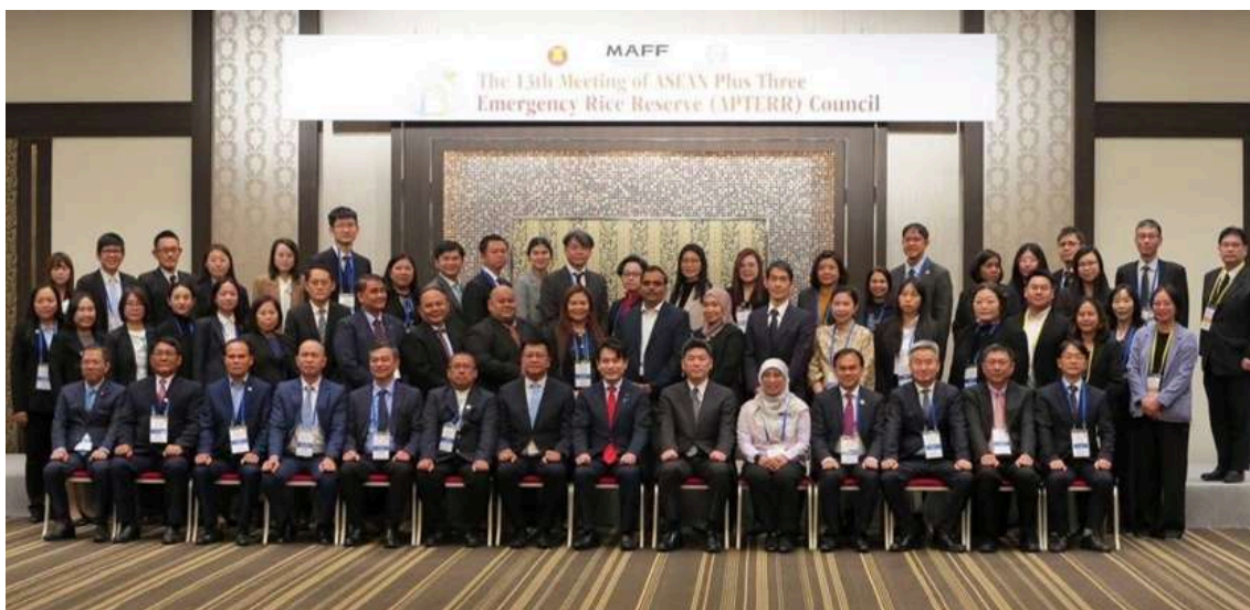
The 13 th Meeting of APTERR Council