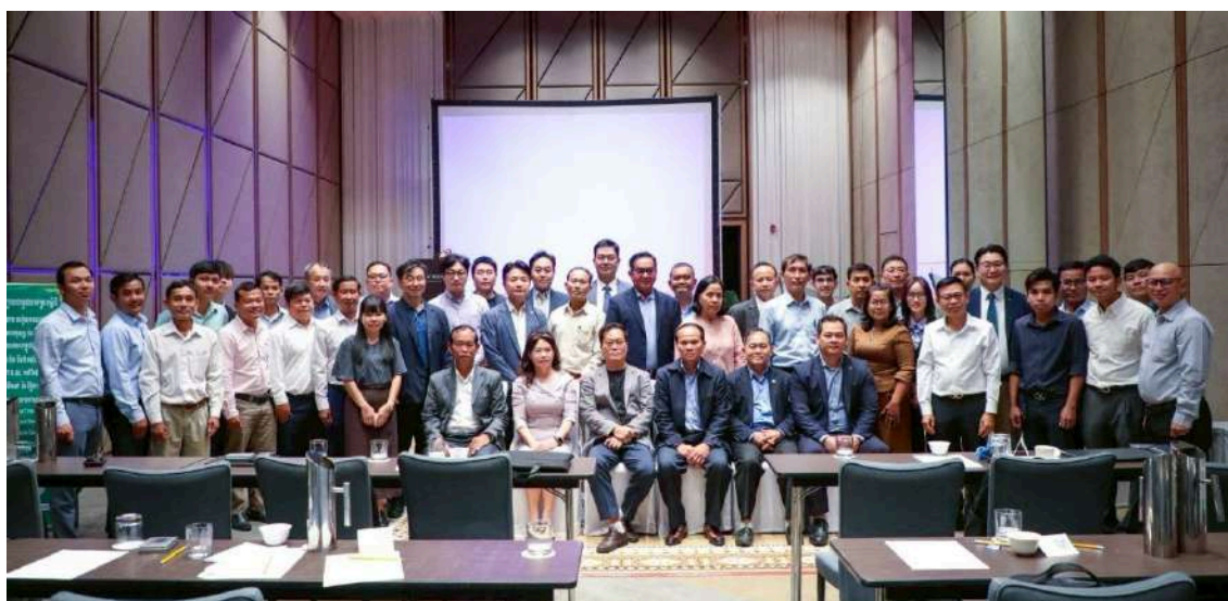
Completion and Handover Ceremony on AFSIS Phase 3 Cooperation Project (Cambodia)