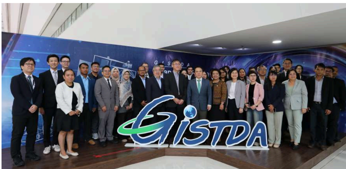
1st Inception Workshops

The workshop was held on 22–24 January 2025 as a physical meeting, where the AFSIS Secretariat, in collaboration with MAFF Japan, the Japan Aerospace Exploration Agency (JAXA), the Remote Sensing Technology Center of Japan (RESTEC), and the Geo-Informatics and Space Technology Development Agency (GISTDA), conducted inception workshops, executive seminars, and hands-on training courses. The seminar, held at GISTDA Headquarters in Bangkok, focused on improving rice paddy area statistics and damage assessment using Earth observation satellites, while hands-on training sessions were conducted at the GISTDA Training Center in Sriracha, Chonburi Province. Agricultural statisticians and technical staff received practical training on the INAHOR system, including software installation and use of QGIS, Google Earth Pro, and Google Earth Engine for rice area estimation. This activity marked the first meeting under the SAFER Project and the Japan–ASEAN Integration Fund (JAIF) project.