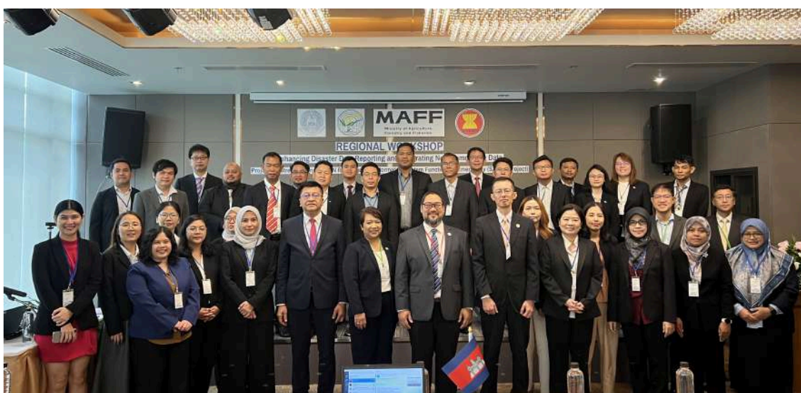
Regional Workshop in Chonburi province