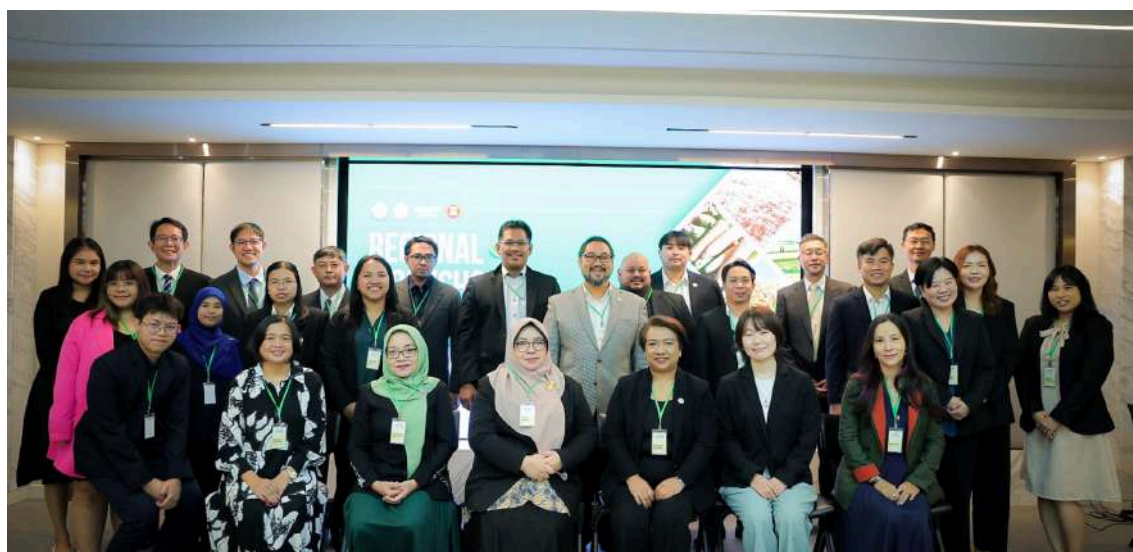
The Regional Workshop on RGO and MGO Preparation Guideline under SAFER Project

The workshop was held on 10–11 September 2025 in Bangkok, Thailand, where the AFSIS Secretariat, with support from MAFF Japan, organized the Regional Workshop on Rice Growing Outlook (RGO) and Maize Growing Outlook (MGO) Preparation Guidelines. The workshop was attended by 30 participants from ASEAN Plus Three Member States and focused on improving the collection, analysis, and interpretation of rice and maize production data using meteorological information, while promoting consistency and comparability of outlook reports across the region.