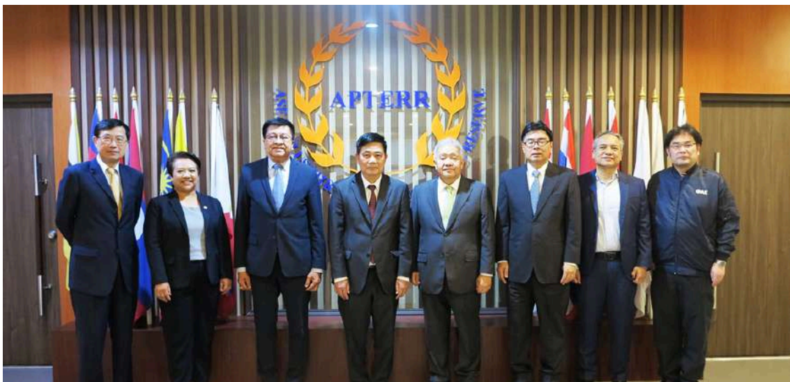
APTERR-ADB Workshop on 'Building Resilient Rice Market and Robust Policy Framework in Asia