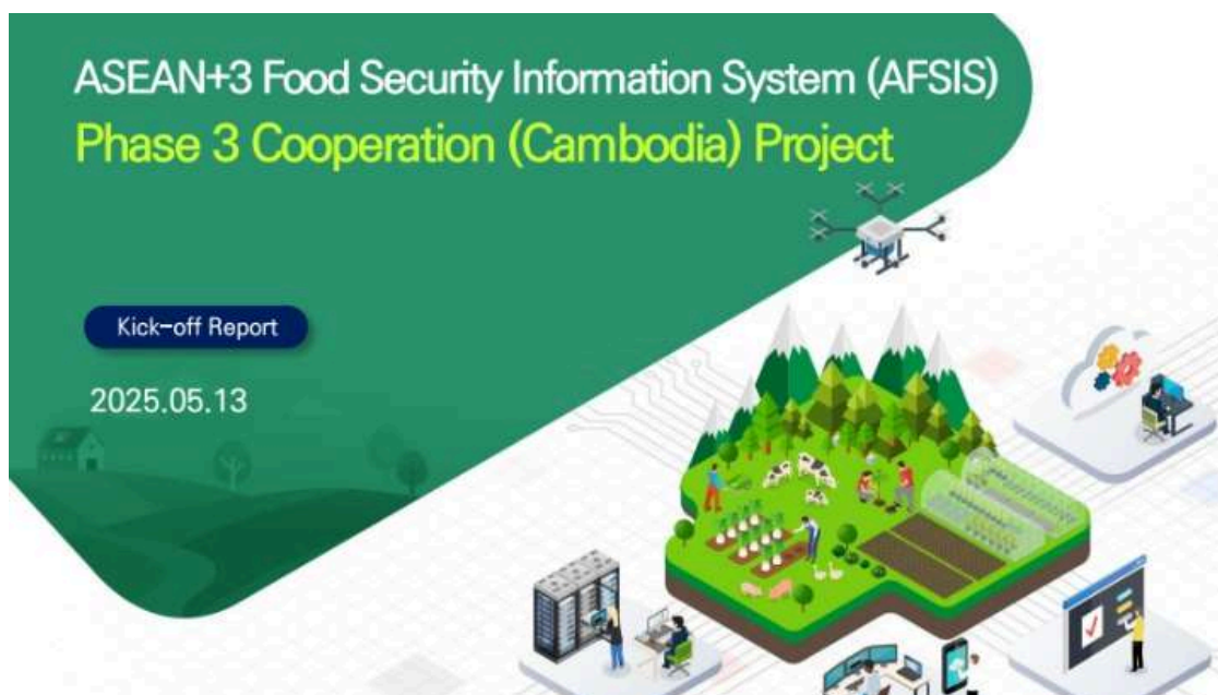
Kick-off Meeting on AFSIS Phase 3 Cooperation Project (Cambodia)