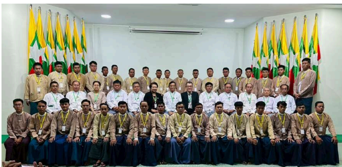
In-Country Workshop in Myanmar

The workshop was held on 23–24 June 2025 in Nay Pyi Taw, Myanmar, where the AFSIS Secretariat, in collaboration with JAXA, RESTEC, and the Settlement and Land Records Department (SLRD) under the Ministry of Agriculture, Livestock and Irrigation (MOALI), conducted an in-country workshop on rice area estimation using space-based technologies. Participants from SLRD headquarters and regional offices enhanced their capacity to apply satellite data, particularly ALOS-2 and Sentinel-2, for rice monitoring through the INAHOR system, contributing to improved agricultural statistics and national implementation under the SAFER Project.