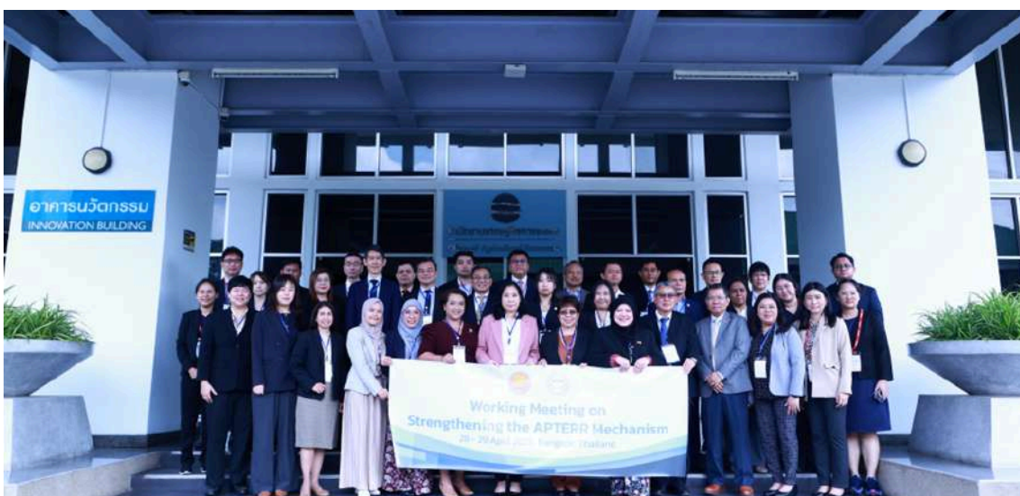
Working meeting on strengthening the APTERR mechanism

The meeting was held on 28–29 April 2025 in Bangkok, Thailand, as a hybrid meeting hosted by the APTERR Secretariat and ADB. The meeting reviewed and discussed enhancements to the APTERR mechanism in response to emerging food security challenges, drawing on findings from ADB's systematic review. Discussions covered future strategic directions, including the integration of initiatives such as ADB's Sub-Regional Hub, China's Public Warehouse, Japan's Rice Storage Hub (Tier 3 FLEX), and the proposed inclusion of a wheat stockpile under APTERR. Participants also exchanged views on preparations for the APTERR Table Top Exercise (TTX), while the Economic Research Institute for ASEAN and East Asia (ERIA) provided updates on its study on Local Resource-Based Food Reserves (LRBFR).