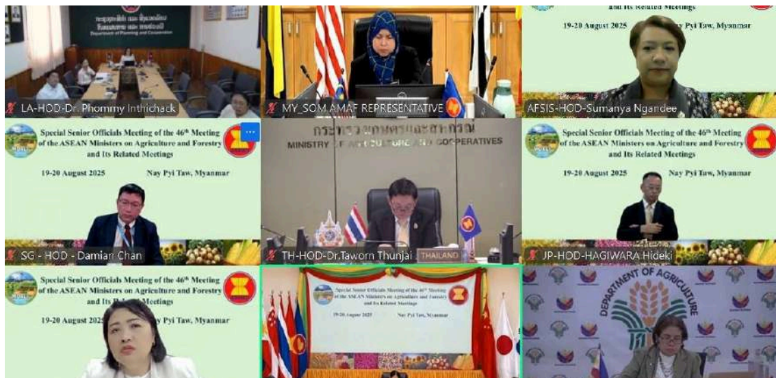
SSOM-24 th AMAF+3 Meeting

The meeting was held on 20 August 2025, hosted by Myanmar as a conference meeting. During the session, the AFSIS Secretariat presented activities implemented during 2024–2025 (Q2), the future work plan, and introduced the upcoming AFSIS-GIS Project. The Secretariat also highlighted that AFSIS would initiate discussions on strengthening financial sustainability, building on the Joint Understanding to be further discussed at the AFSIS Special Workshop in Japan in October 2025. The meeting noted the AFSIS progress report, which included updates on administrative functions, human resource development, food security information development, and cooperation projects with Plus Three countries and relevant organizations. Member States reaffirmed the importance of AFSIS and expressed commitment to continued discussions aimed at strengthening its long-term sustainability and operational capacity. The Joint Press Statement of the AMAF+3 Meeting is provided in Annex II