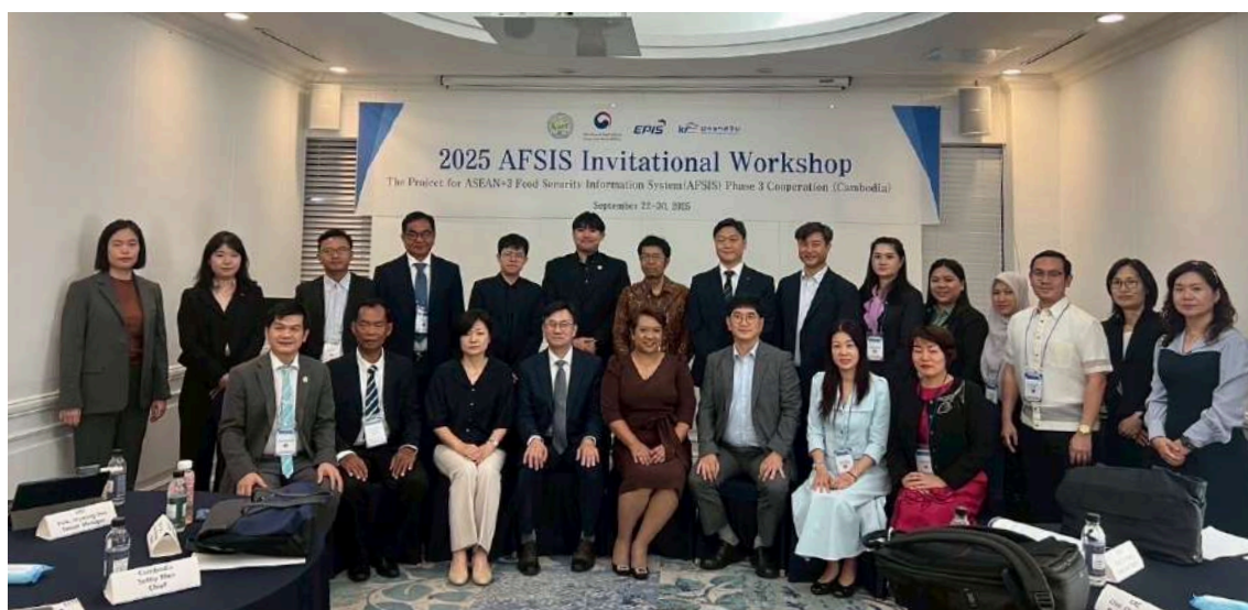
Invitation Workshop on the Project for Establishing Real-Time AFSIS and Human Resources Development

The workshop was held on 21–30 September 2025 as a physical workshop in Seoul, the Republic of Korea, where the AFSIS Secretariat participated in collaboration with MAFRA, Korean Rural Community Corporation (KRC), the Korea Agency of Education, Promotion and Information Service in Food, Agriculture, Forestry and Fisheries (EPIS), and EGIS Co., Ltd. The workshop aimed to share progress of the Real-Time AFSIS Project (Phase 3) implemented in Cambodia and to enhance participants' capacity in utilizing agricultural statistics, information and communication technology (ICT), and forecasting models for food security. The workshop also provided a platform for ASEAN Member States to present country reports and action plans to strengthen agricultural data management and food security frameworks. Participants gained practical knowledge through lectures, discussions, and field visits to key agricultural and technological institutions in Korea, including the Rural Development Administration, the Gimje Agricultural Technology Center, and the Agriculture Expo at the aT Center, with a focus on smart agriculture and geospatial information technologies. The workshop concluded with presentations of country reports and action plans, reinforcing regional cooperation and knowledge exchange for the sustainable development of food security information systems.