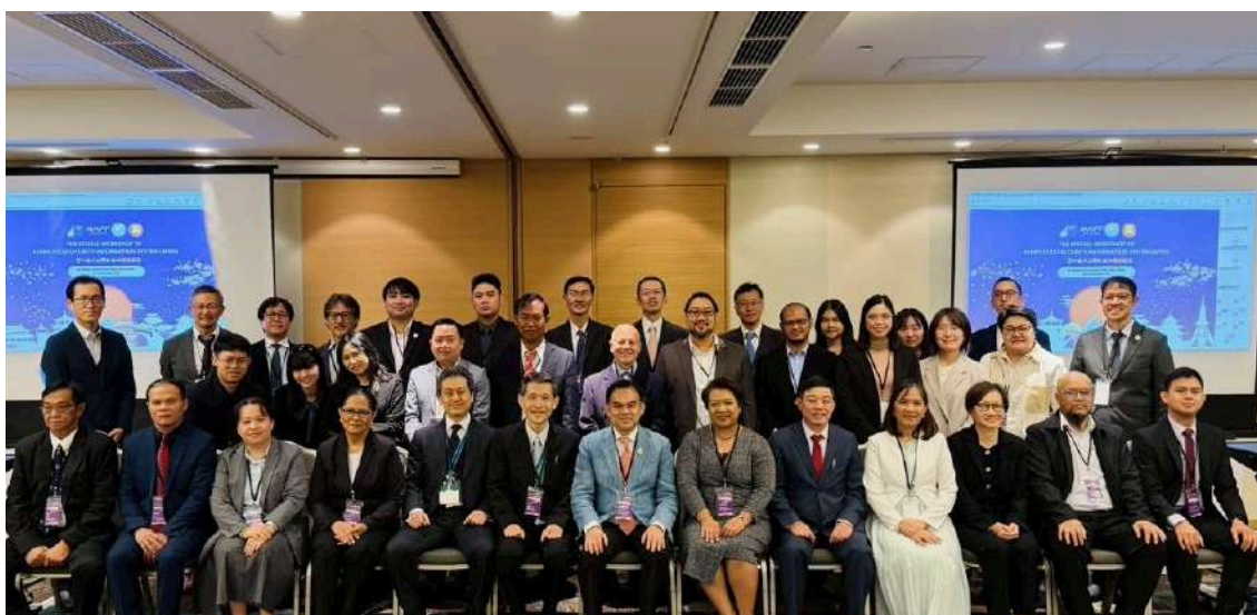
AFSIS Special Workshop

The meeting was held on 22–23 October 2025 in Tokyo, Japan, where the AFSIS Secretariat, in collaboration with MAFF Japan, convened the AFSIS Special Workshop with participation from the 10 ASEAN Member States, the Plus Three countries, and representatives from FAO, RESTEC, and JAXA. The workshop presented progress and key achievements of the SAFER Project, introduced the implementation plan of the AFSIS-GIS Project (2025–2028), and provided a platform for discussions on strengthening AFSIS’s operational and financial sustainability. Participants recognized that long-term sustainability requires not only financial resources but also continued technical collaboration, capacity development, and strong partnerships among ASEAN Plus Three countries.