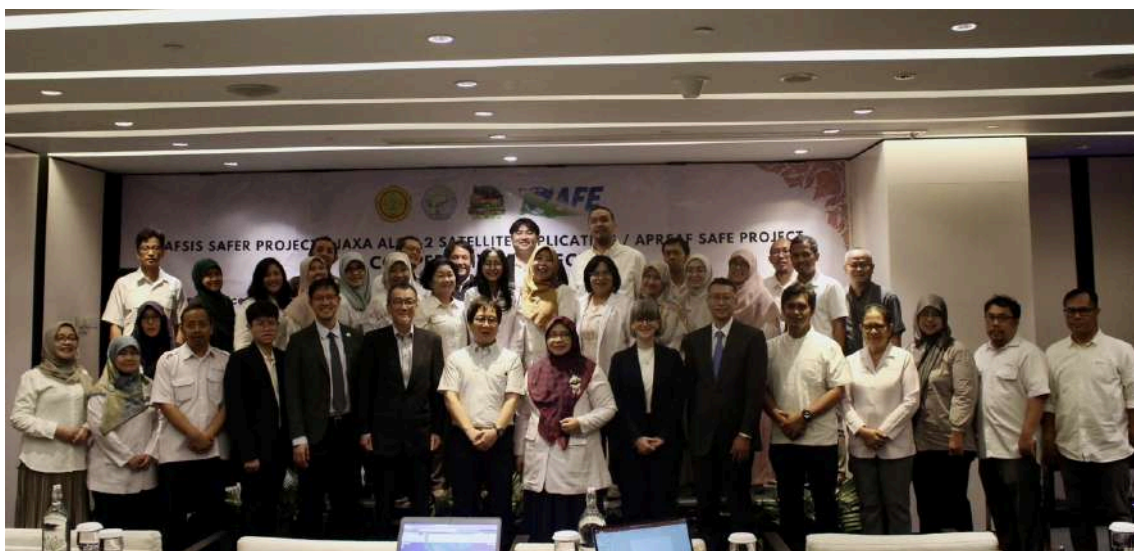
In-Country Workshop in Indonesia