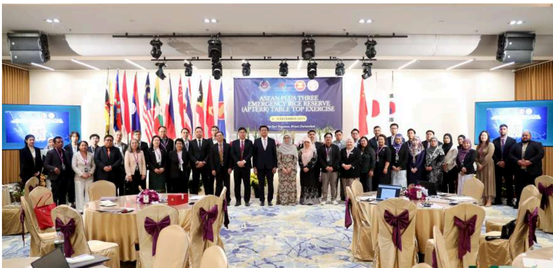
APTERR Table Top Exercise (TTX)

The meeting was held on 3–4 December 2025 in Bandar Seri Begawan, Brunei Darussalam, where the AFSIS Secretariat participated in the APTERR Table Top Exercise (TTX). The exercise assessed the readiness and effectiveness of the APTERR mechanism across all three tiers, strengthened coordination among relevant agencies, and enhanced the use of digital tools for early warning and information sharing. During the exercise, the AFSIS Manager presented the role of AFSIS in providing credible and timely food security information and participated in group discussions to advance collaboration between AFSIS and APTERR, including under the FEMI framework. The exercise reinforced regional preparedness and cooperation in responding to food security emergencies.