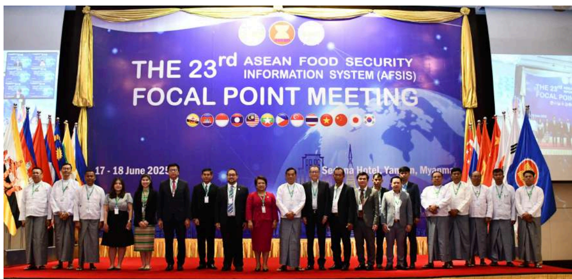
The 23 rd AFSIS Focal Point Meeting

The meeting was held on 17–18 June 2025 in Yangon, Republic of the Union of Myanmar, as a hybrid meeting, hosted by the Ministry of Agriculture, Livestock, and Irrigation (MOALI) of Myanmar in collaboration with the AFSIS Secretariat. The main objectives of the meeting were to inform ASEAN Plus Three Member States of the overall outcomes and achievements of AFSIS activities during 2024–2025 (Q2) and to present the future work plan for 2025. The meeting also provided a forum for participants to exchange views and provide comments on the future direction of AFSIS and the progress toward its transformation into a permanent mechanism to ensure long-term sustainability. In addition, the meeting introduced the progress and work plan of the Project for Strengthening ASEAN Food Security Information System Function for Emergency (SAFER), the new Japan-supported project for AFSIS Geospatial Informatization Support (AFSIS-GIS), and a joint proposal on the publication of International Asian Harvest mOnitoring system for Rice (INAHOR) crop area estimation results by AFSIS. The meeting served as an important platform for fostering collaboration and strengthening commitment to sustainable food security in the ASEAN region. The list of delegates is provided in Annex I