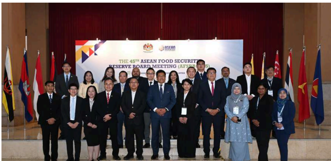
The 45 th AFSRB Meeting

In addition, the importance of sustainability, in line with the Joint Understanding on the sustainability of AFSIS, was emphasized, and the meeting was informed of the upcoming AFSIS Special Workshop in Japan in October 2025, focusing on strengthening the future workplan and AFSIS's financial sustainability.