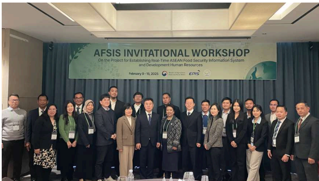
The Invitational Workshop on the Project for Establishing Real-Time AFSIS and Development Human Resources in Seoul, Korea